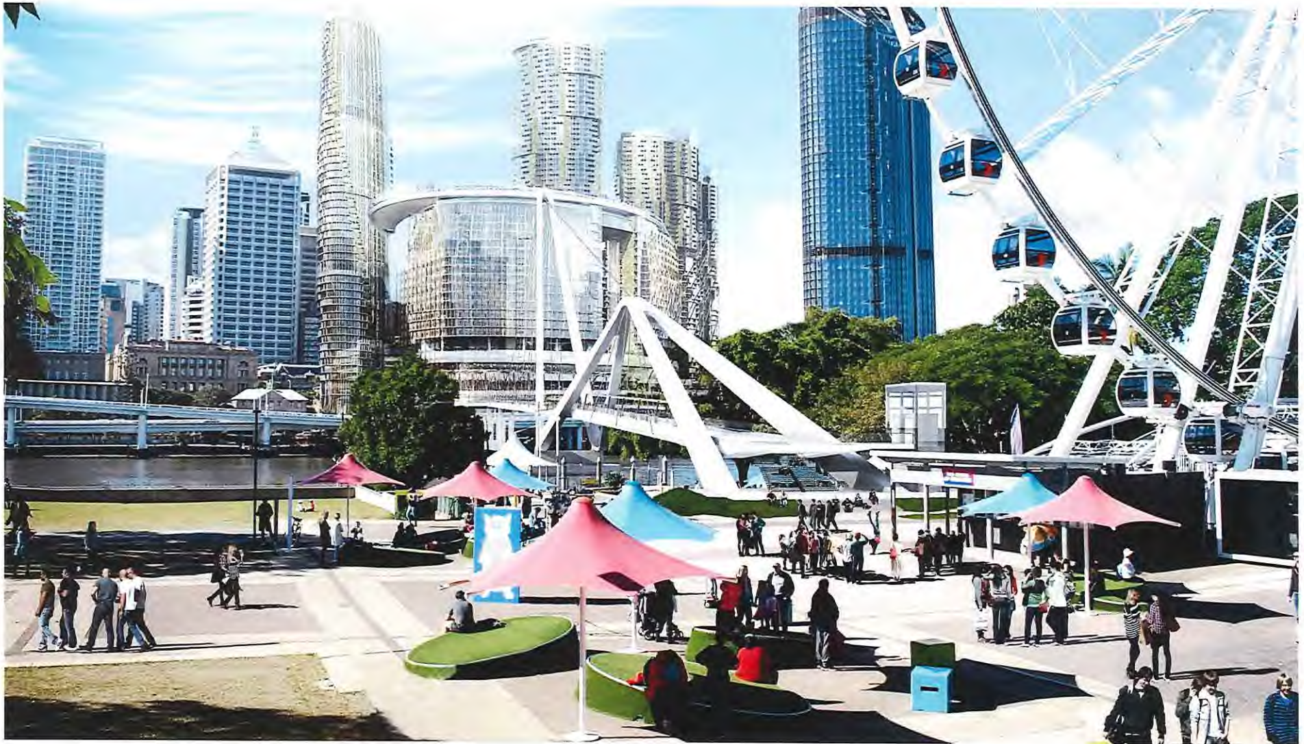
Figure 3: Area B—Proposed pedestrian bridge (artist's impression looking from South Bank Parklands to Queen's Wharf)