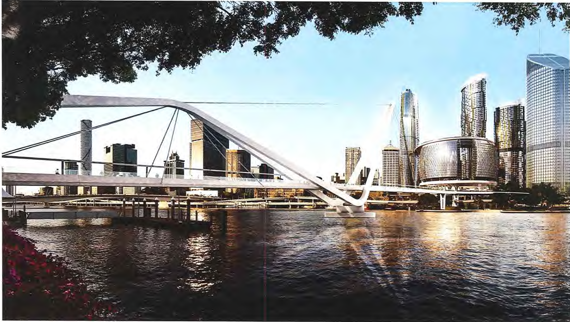
Figure 2: Area B—Proposed pedestrian bridge (artist's impression looking from South Bank Parklands to Queen's Wharf)